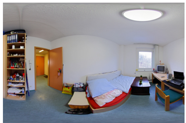
(example photo; the actual room comes unequipped)